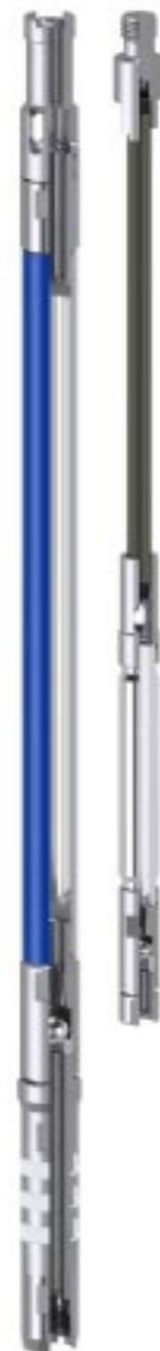
RXBC API Insert Pump